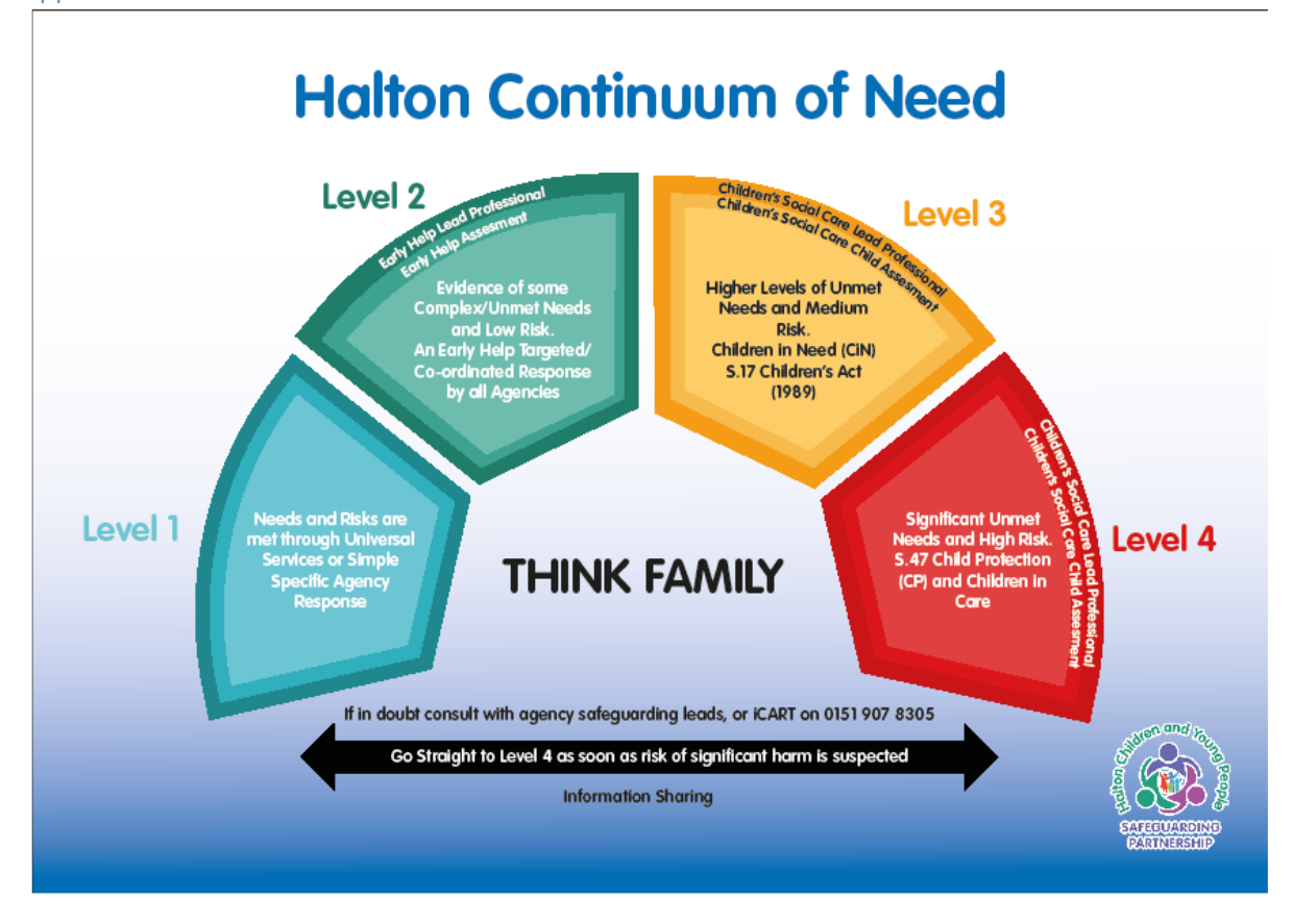
Appendix B – Halton's Continuum of Need Framework